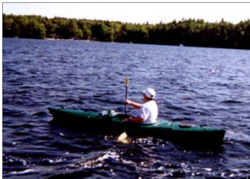
Intrepid Kayaker Braving Thompson's waves during last summer's I-Did-A-Paddle.