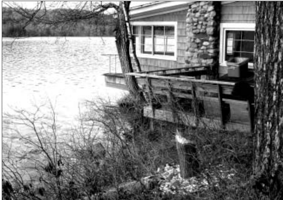
Environmental Engineers at Work at the Cape in Otisfield: The Results of the Beavers’ Hard Work Are Displayed Near the Cape’s “Honeymoon Cottage.”

And remember – the property owner pays only for materials and plants. The YCC’s labor is free. It’s a good deal.