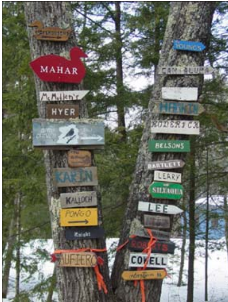
Here's where we are: Signpost on Forrest Edwards Road, Otisfield