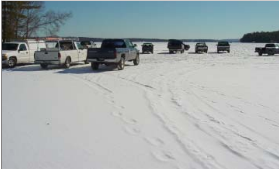
Gone Fishin': Otisfield Cove Road, Saturday morning in February