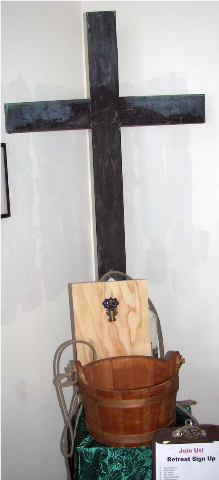
The St. Matthew's Women's Retreat Lobby display.